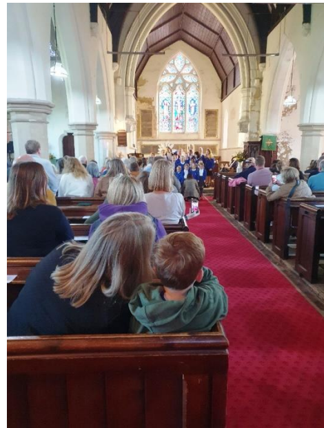
St Mary's Harvest Festival