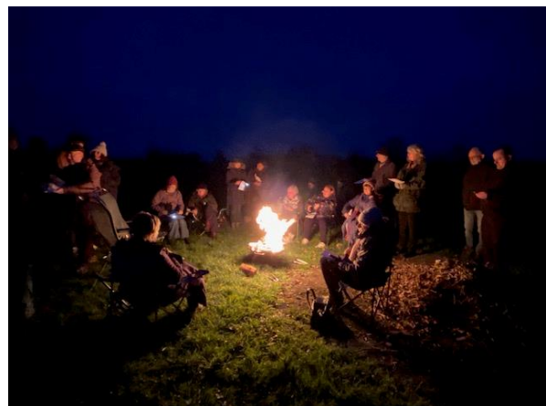
Easter Vigil – awaiting the dawn.