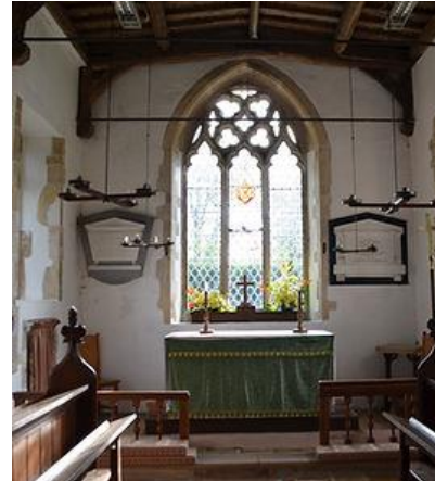
St Peter's Upwood (with the Raveleys)