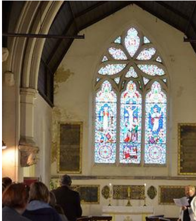
St Mary's: Ramsey St Mary's

A community with roots planted in hospitality and servanthood. Serving God by serving others.