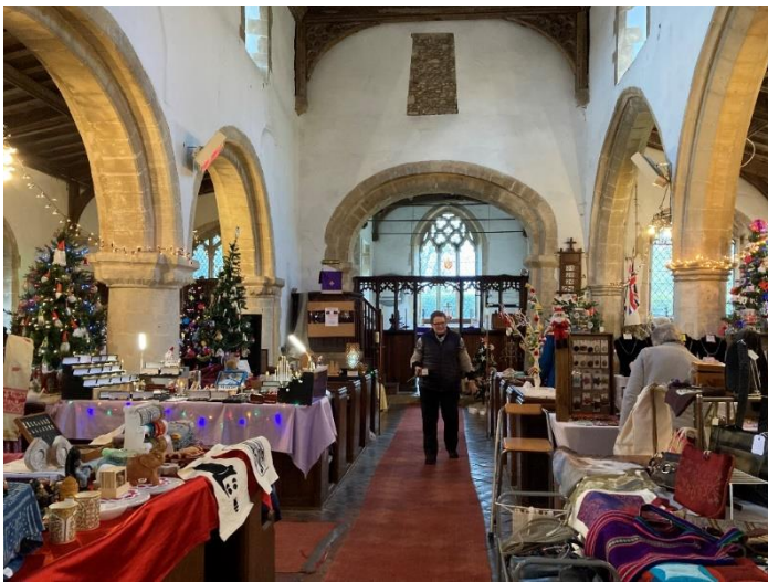
St Peter's Christmas Tree Festival