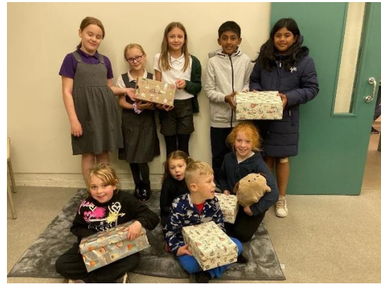
3 in 1 Club with shoeboxes