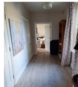
Corridor leading to study