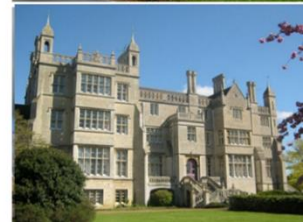
Duck pond (above) Part of Abbey College