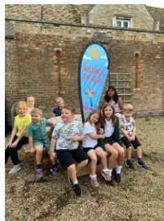
3 in 1 Club