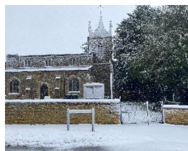
St Peter's in snow