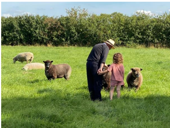
Fen Church meeting fellow creatures.

Although we have clear plans for moving forward, at the same time we do not want to forget our service to life-long members of both the congregation and community. Inherited forms of worship remain important to many.