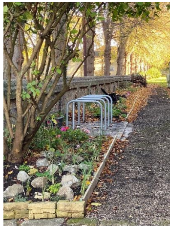
Our new eco garden