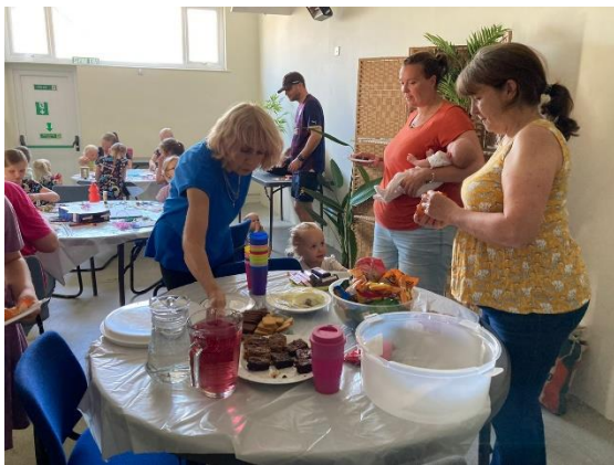
Preparation for Eco Fair