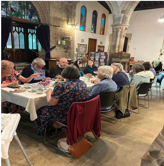
Thank you tea-party for Open the Book Team