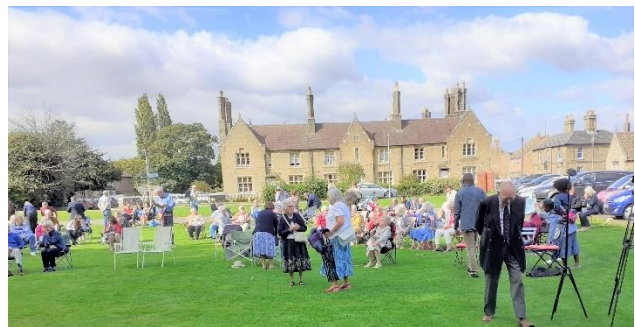
First service after lockdown