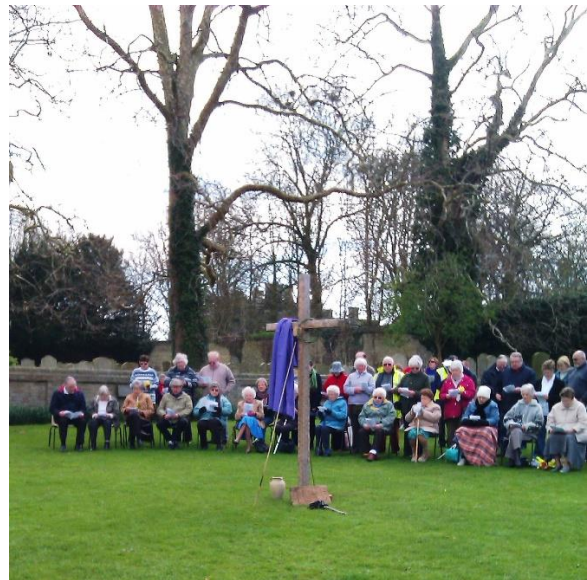
Ecumenical Good Friday Service on the Green