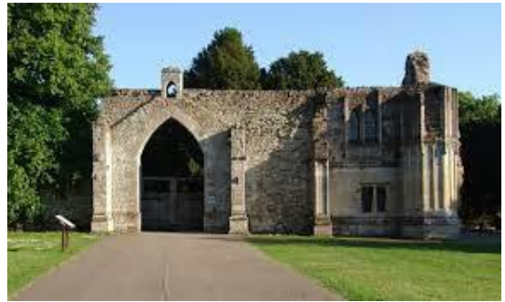
Ramsey Abbey Gatehouse – National Trust