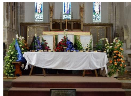
A Flower Festival arrangement