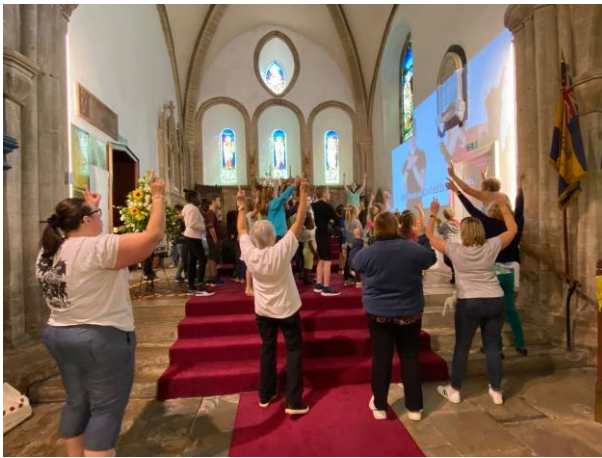
Children's Summer Club