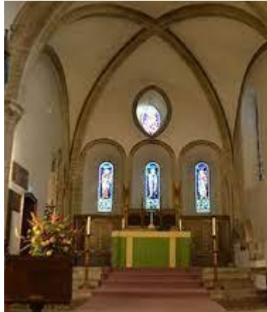
St Thomas à Becket: Ramsey