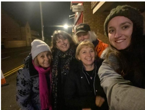
Out in the community with hot chocolate on Hallowe'en