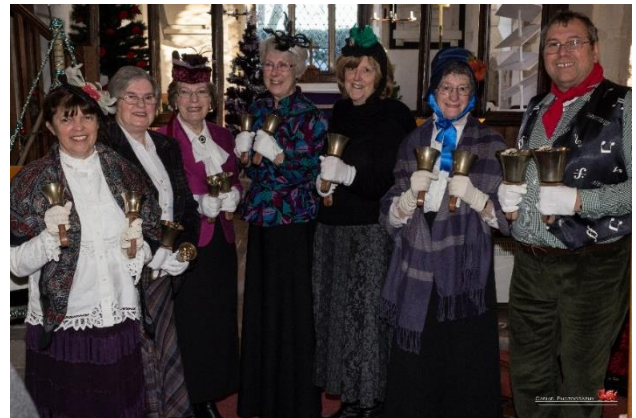
St Peter's Handbell Ringers