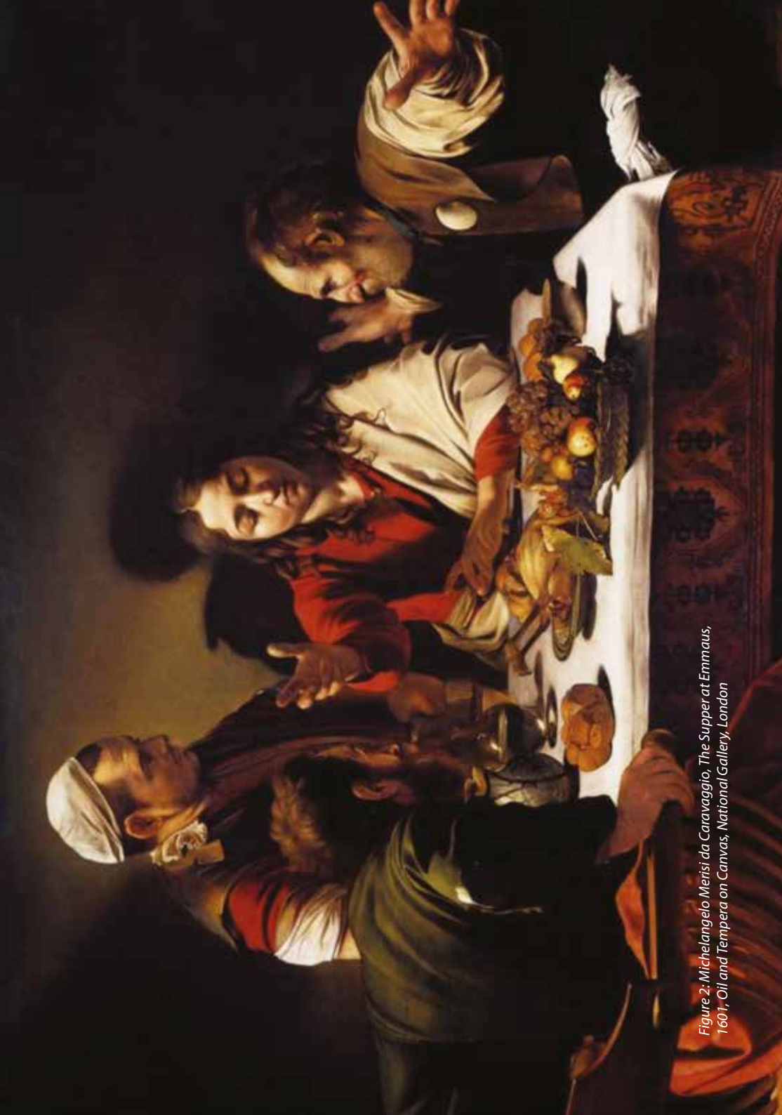
Figure 2: Michelangelo Merisi da Caravaggio, The Supper at Emmaus , 1601, Oil and Tempera on Canvas, National Gallery, London