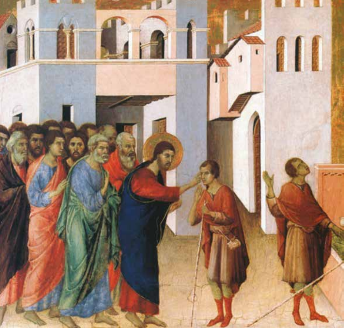
Figure 3: Jesus Opens the Eyes of a Man born Blind (1311), Duccio di Buoninsegna. National Gallery London. Egg Tempera on wood