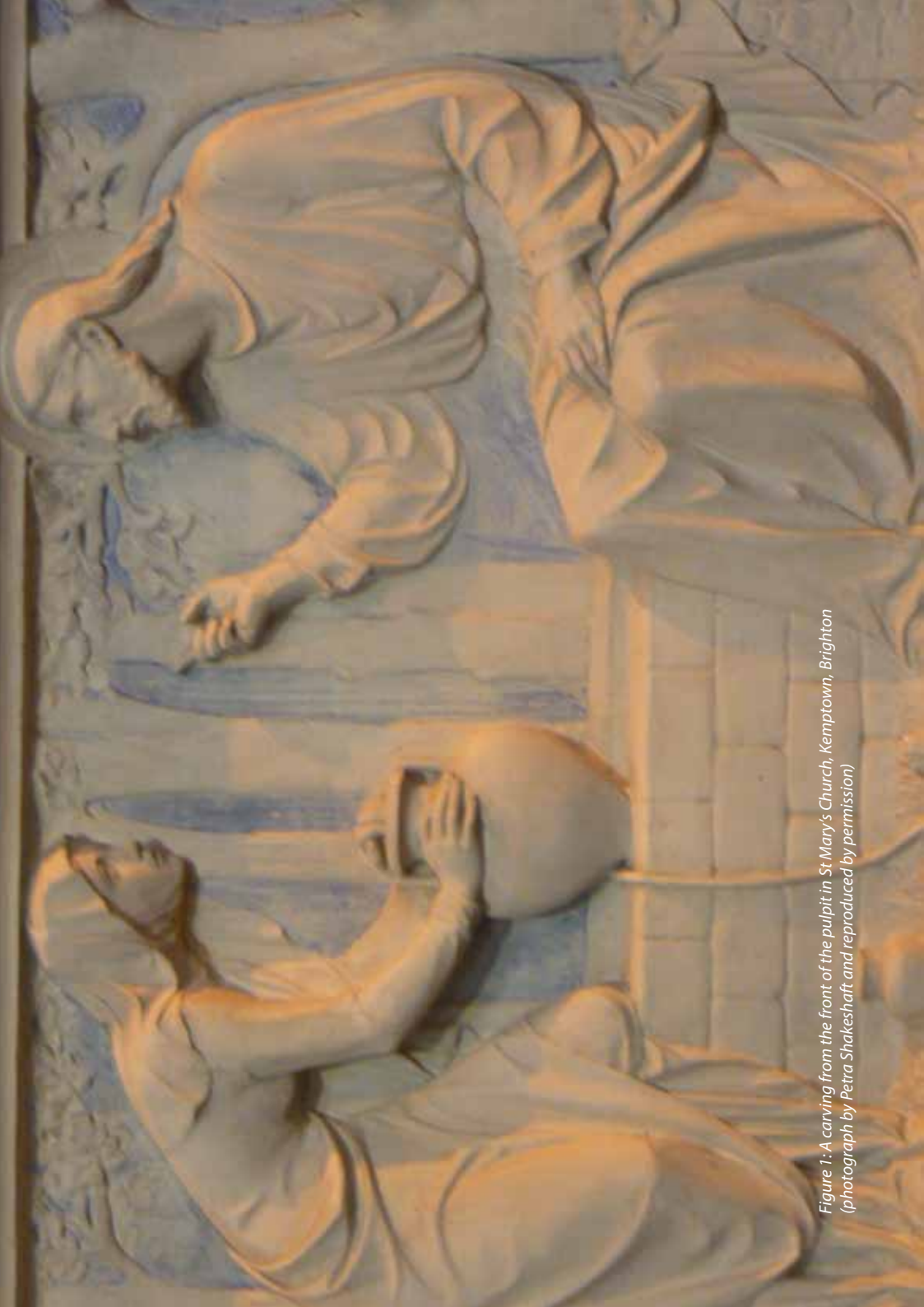
Figure 1: A carving from the front of the pulpit in St Mary's Church, Kempton, Brighton