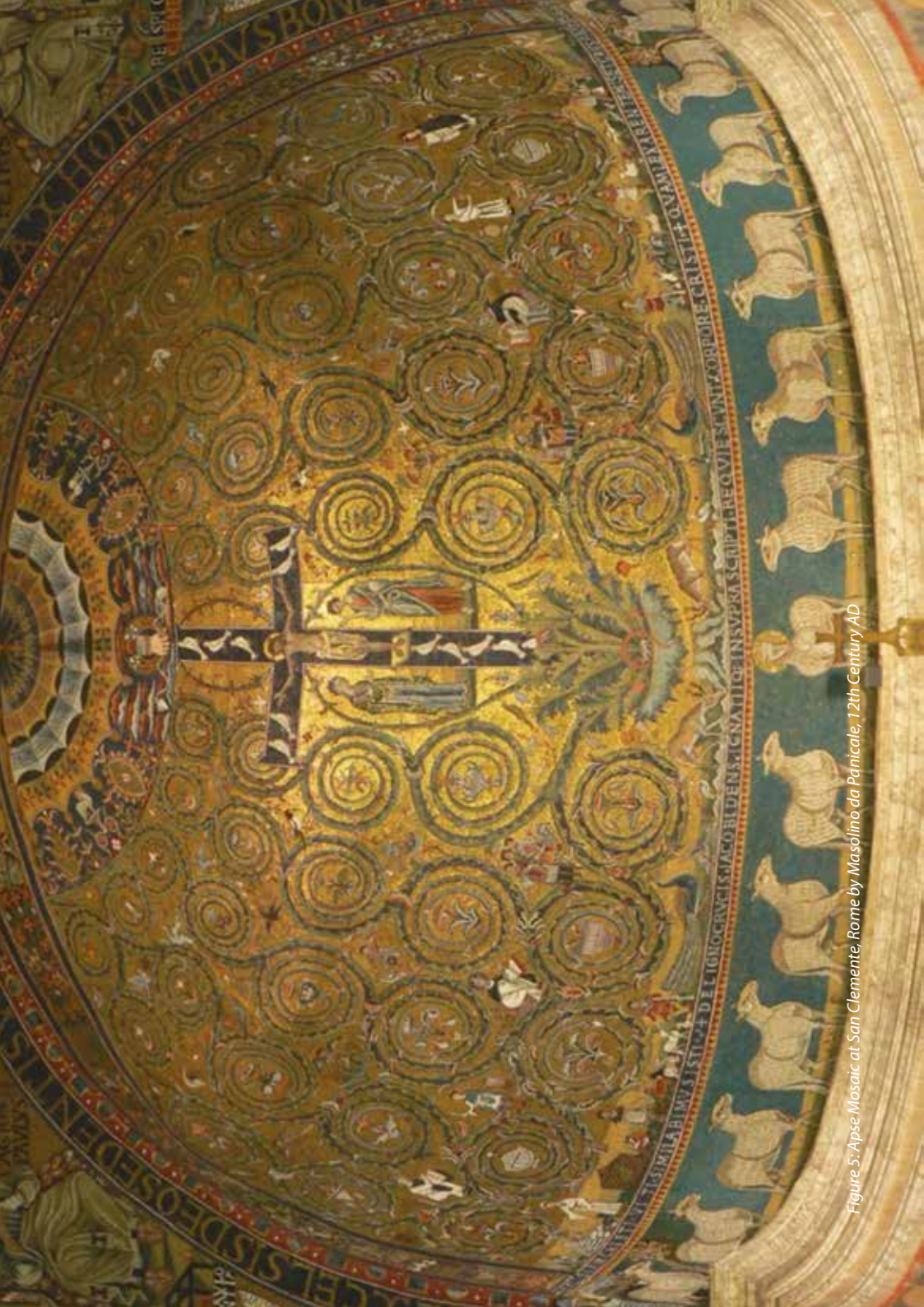
Figure 5: Apse Mosaic at San Clemente, Rome by Masolino da Panicale, 12th Century AD