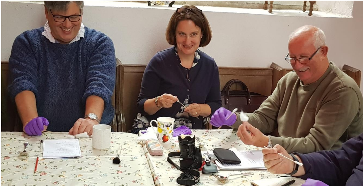
Making cotton swabs on a conservation cleaning workshop in 2019

How to clean church buildings and conserve the unique history of fixtures, fittings and objects.