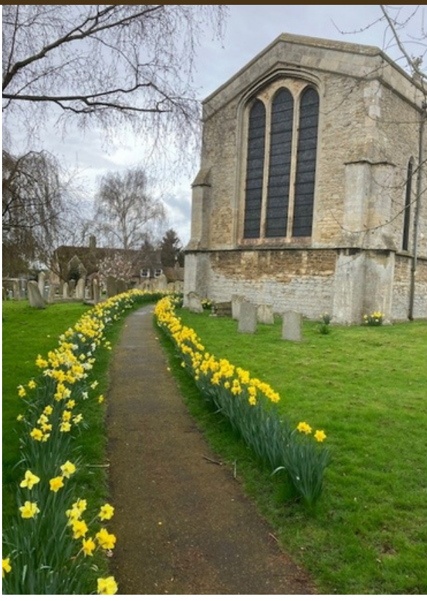
Look what 'Friends can do'. Daffodils planted by the Friends of Somersham Parish Church.