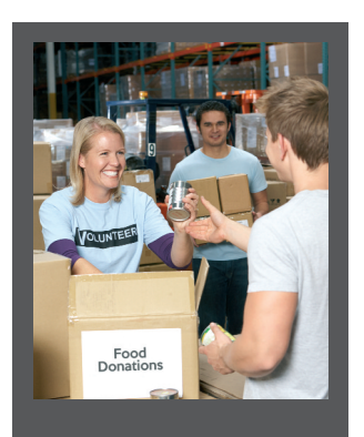
People bring along their foodbank vouchers where they can swap them for a box of food.

In these difficult economic times, more and more churches are setting up foodbanks for people in their parish. If you are running a foodbank, the advice below should help you make sure everything is safe.