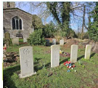
ST SWITHIN'S, OLD WESTON

We believe that St Swithin's is a vital part of Old Weston, but we want to ask for your thoughts, opinions, and memories. What makes St Swithin's special to you? Turn