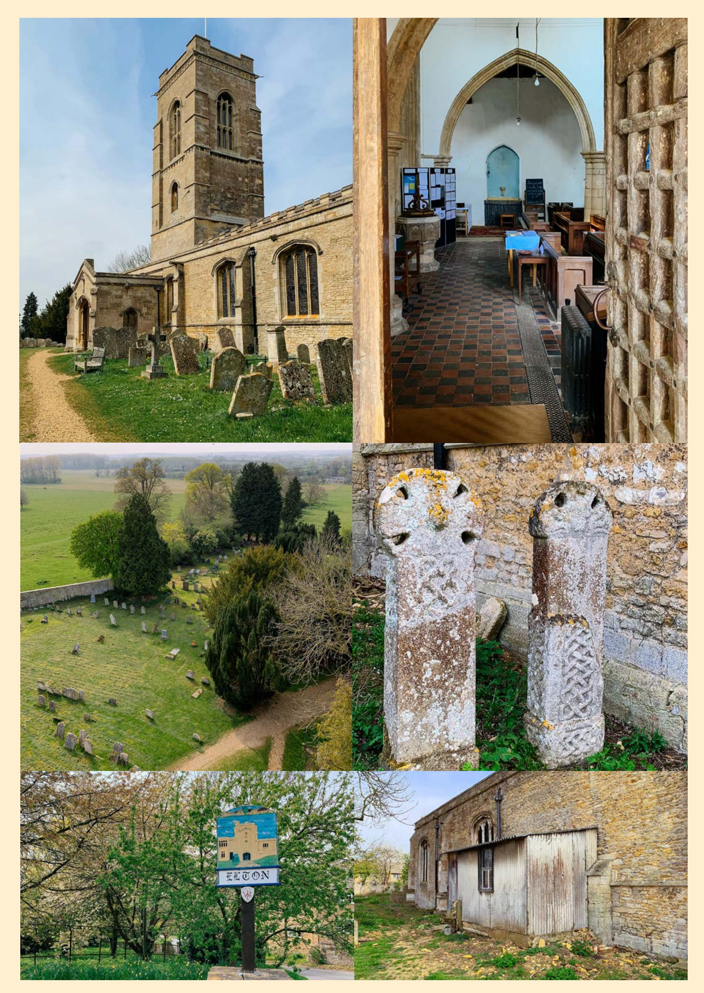
Top: Public footpath and church entrance doors. Middle: View of the churchyard from the All Saints' tower; Wheel crosses from the Saxon period in the churchyard. Bottom: Elton village sign; North wall of the church building with a boiler house.