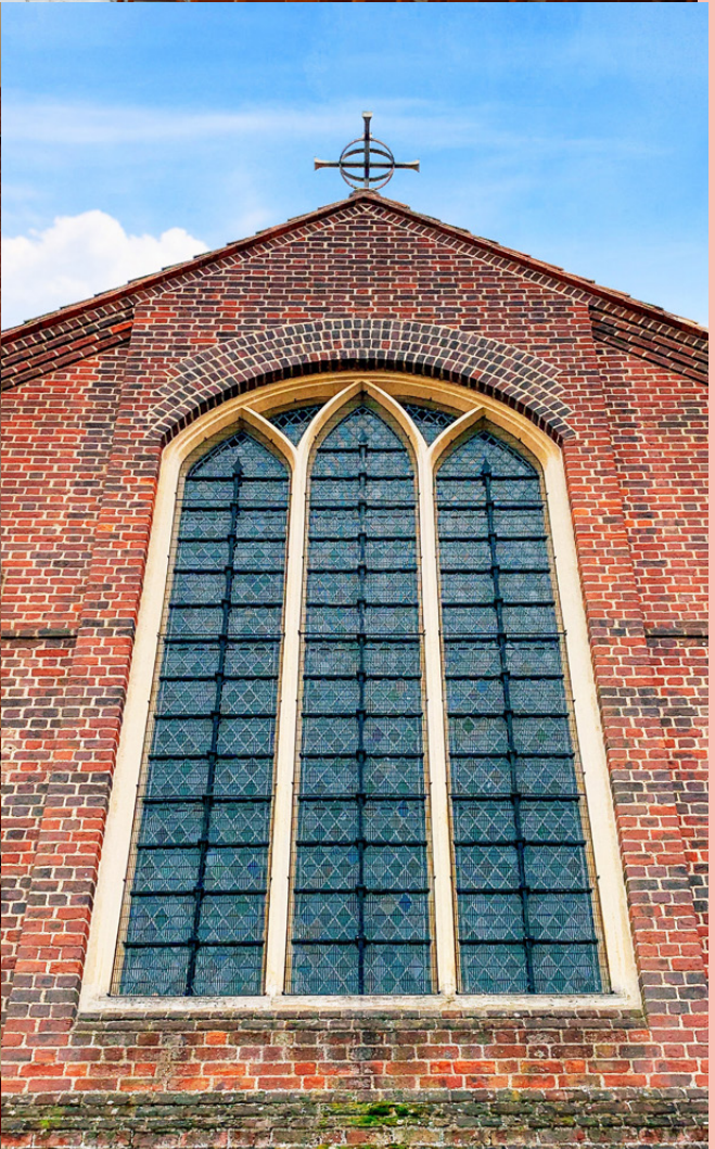
Clockwise from top: View towards chancel from the nave; Exterior view of West window; Lady Chapel's interior.