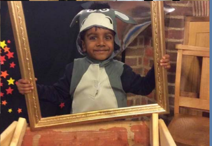
1st row: Activity run by Red Hen Project; Visit by church members to a local care home, Buchan House. 2nd row: Children's activities in the church; Come and Sing Carols at The Good Shepherd. 3rd row: Community Fridge; Children's activity in the church. 4th row: Christmas activities for children in the church.