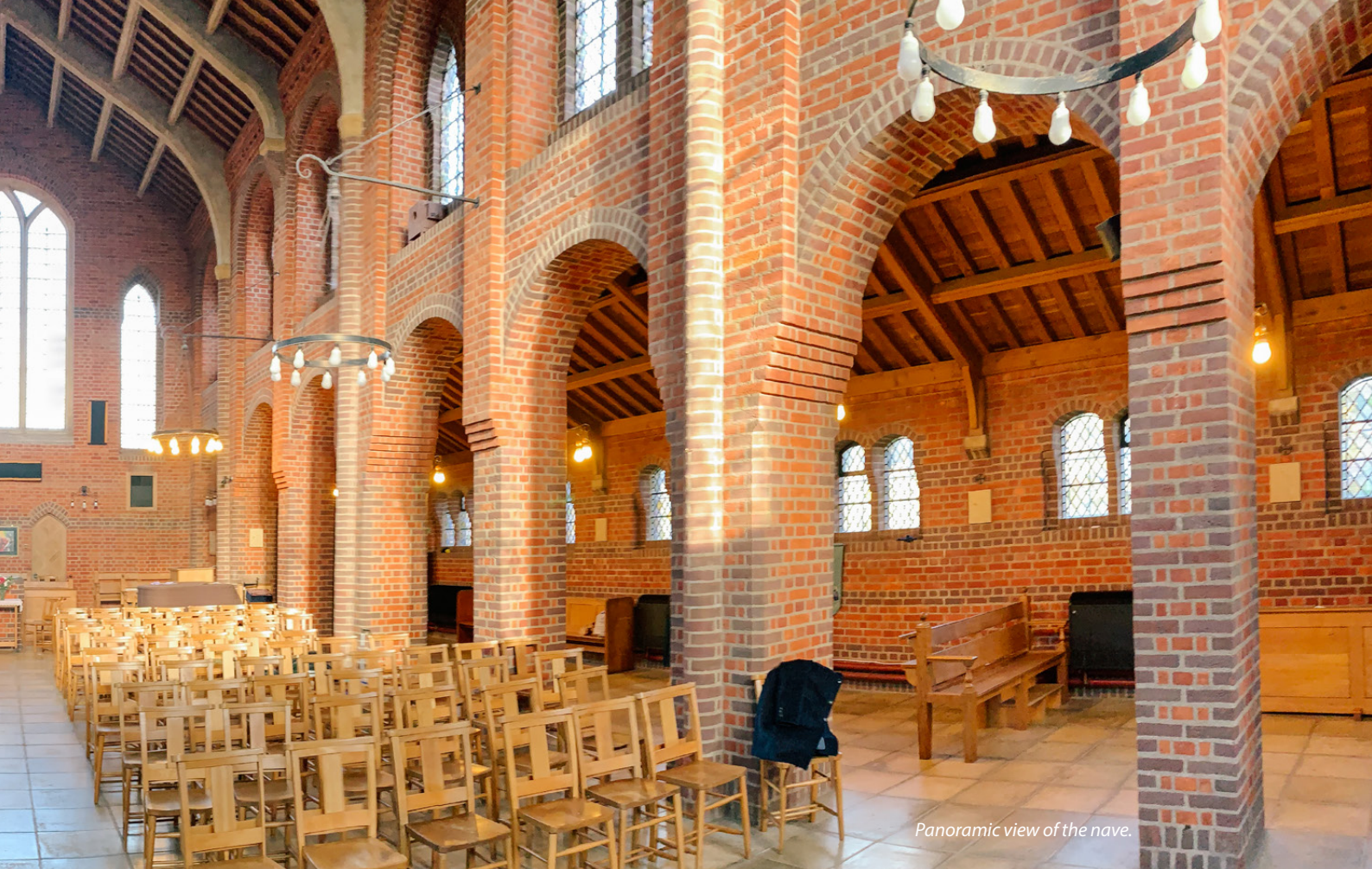
Panoramic view of the nave.