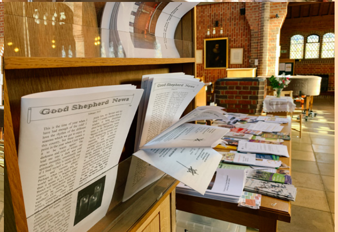
1st row: Harvest made donations to Foodbank by a local primary school; Foodbank. 2nd row: Carols in Arbury Court organised by local churches together with local council representatives; Christmas activities in the church. 3rd row: Mother and toddlers' group event; Foodbank; 4th row: Information stands with publications in the church.