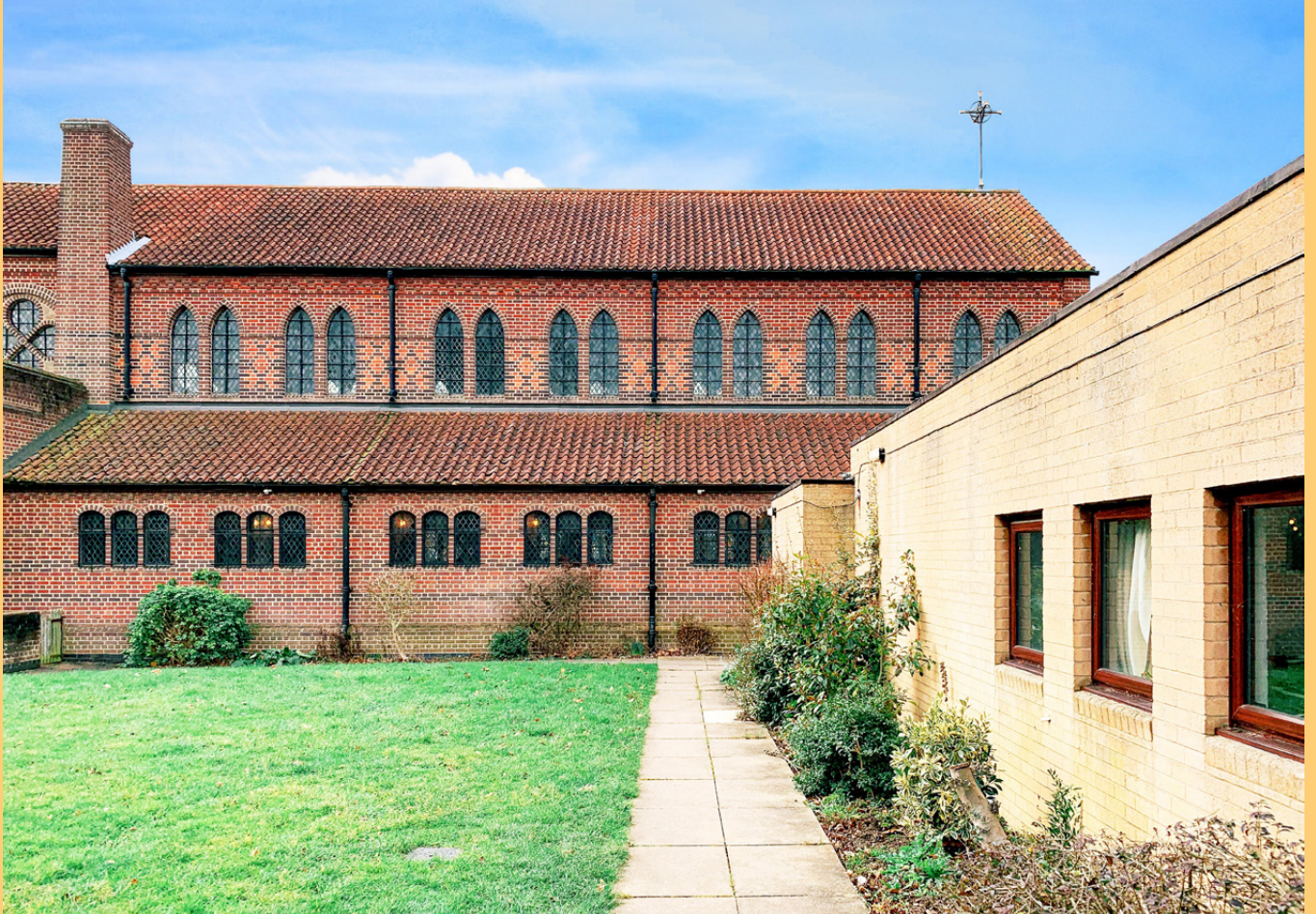
Top: South-west view of the church. Bottom: Northern view of the church and church hall.