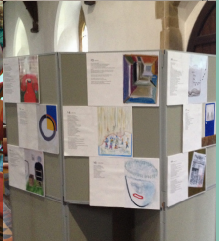
Clockwise from top-left: Caxton church Coffee Morning; 'Breath of Fresh Air' Walking Group (walking on a footpath from Caxton to Bourn); Flyers and pew slips from Caxton church; A display of poems and paintings about dementia in Caxton church ('Lost for Words: Decline into Dementia' by David Potter); 'Bible and Wine' meeting; A wedding at church.