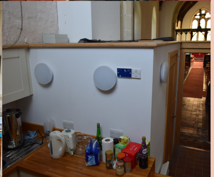
Top: View of the nave with chairs. Middle: View towards the East window and rood screen; Back pews, vestry, and facilities in the tower. Bottom: Children's corner and the font by the entrance; Kitchen area under the tower.