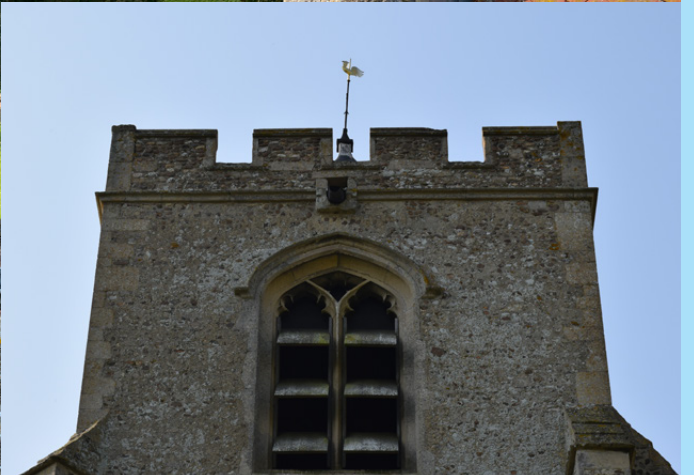
Top: View of the churchyard from the church tower roof. Middle: Belfry and church tower roof. Bottom: Yew tree in the churchyard and the tower.