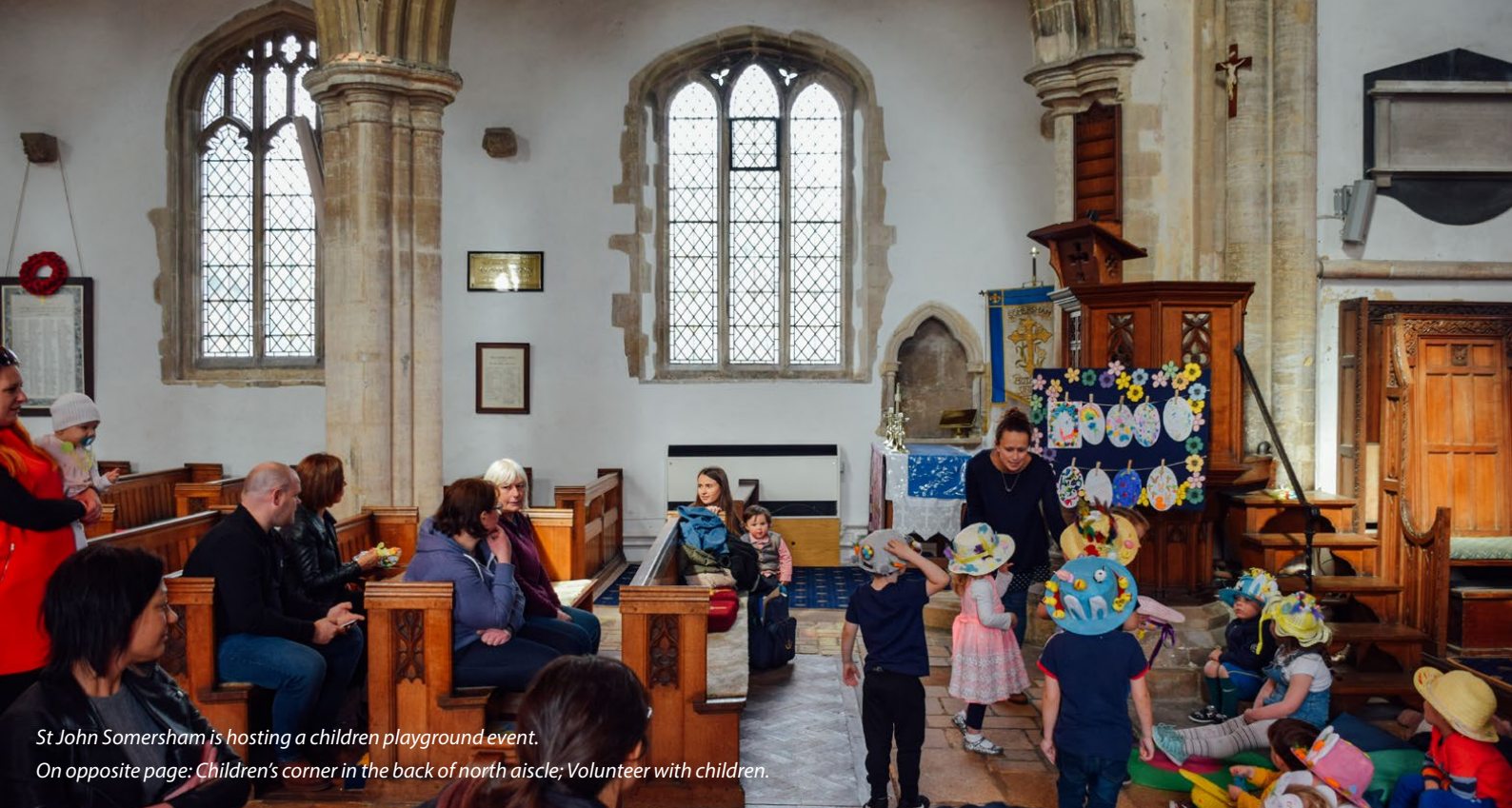
St John Somersham is hosting a children playground event. On opposite page: Children's corner in the back of north aisle; Volunteer with children.