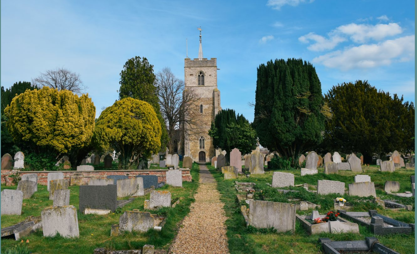
Top: Church noticeboards in Church Street. Middle: Public footpaths in the churchyard. Bottom: West tower view from the churchyard.