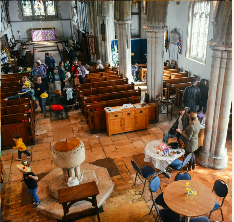
Top and middle: Servery area in the back of the nave with concealed wash basin, cafe tables and chairs, and wall heating radiators. Bottom: Mezzanin room and facilities under the tower; Children playground event in the church.