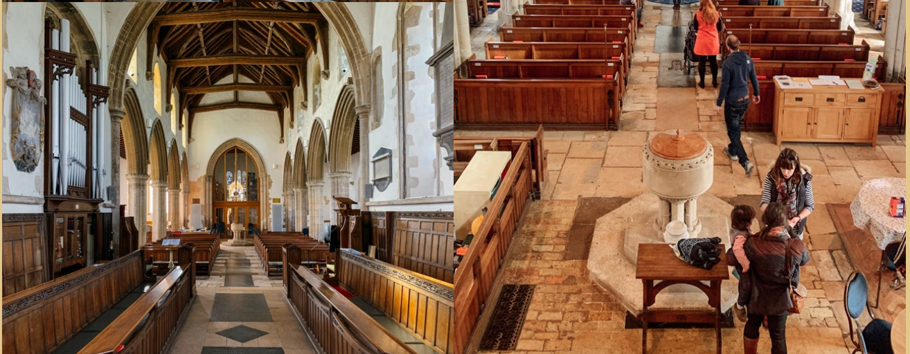
Clockwise from top: Altar view with the font; View from upstairs Mezzanine Room; Choir pews with the nave; Fixed sitting arrangement and the Served area in the back of the nave.