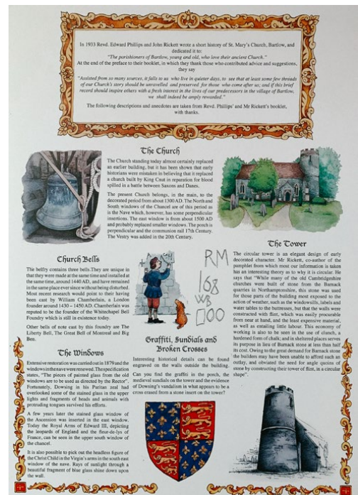
One of the information boards in the church telling a story of its architectural features

In light of the good church family links and church artefacts, the PCC anticipates that there is a scope for a Friends of St Mary's Group.