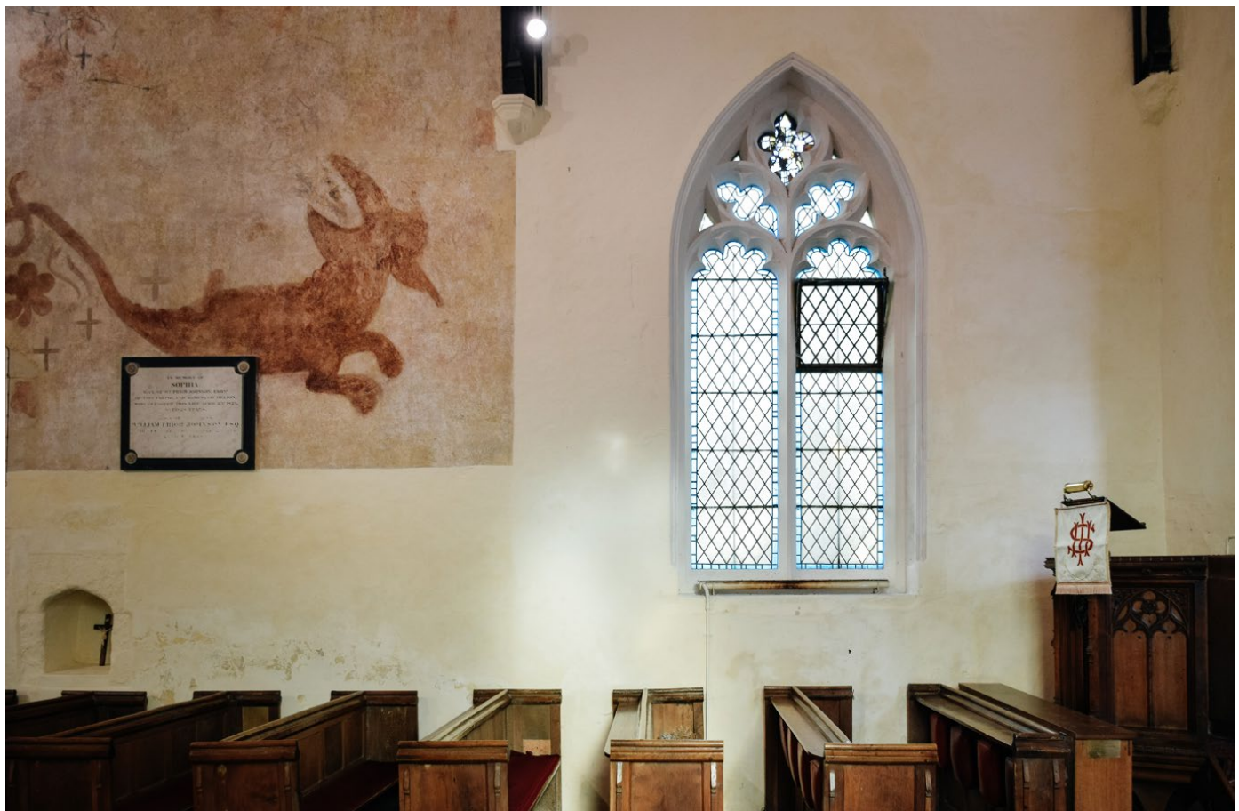
Restored medieval wall paintings on the south (top) and north walls (bottom).