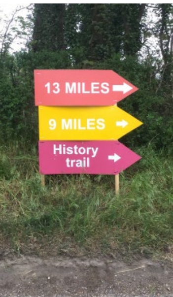
Charity Walk's signposting.

St Mary's Bartlow community support is manifest in 20% of the village population signed up for the church cleaning and flower rotas. In addition, many non-regular attenders come to the church to offer help with various tasks and activities.