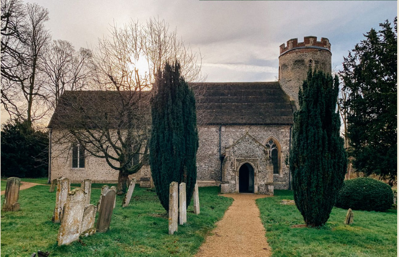
Clockwise: The stained glass of the East window; The nave with the medieval wall paintings; The Bartlow Hills; The view of the Norman circular tower and the north doorway with yew trees.