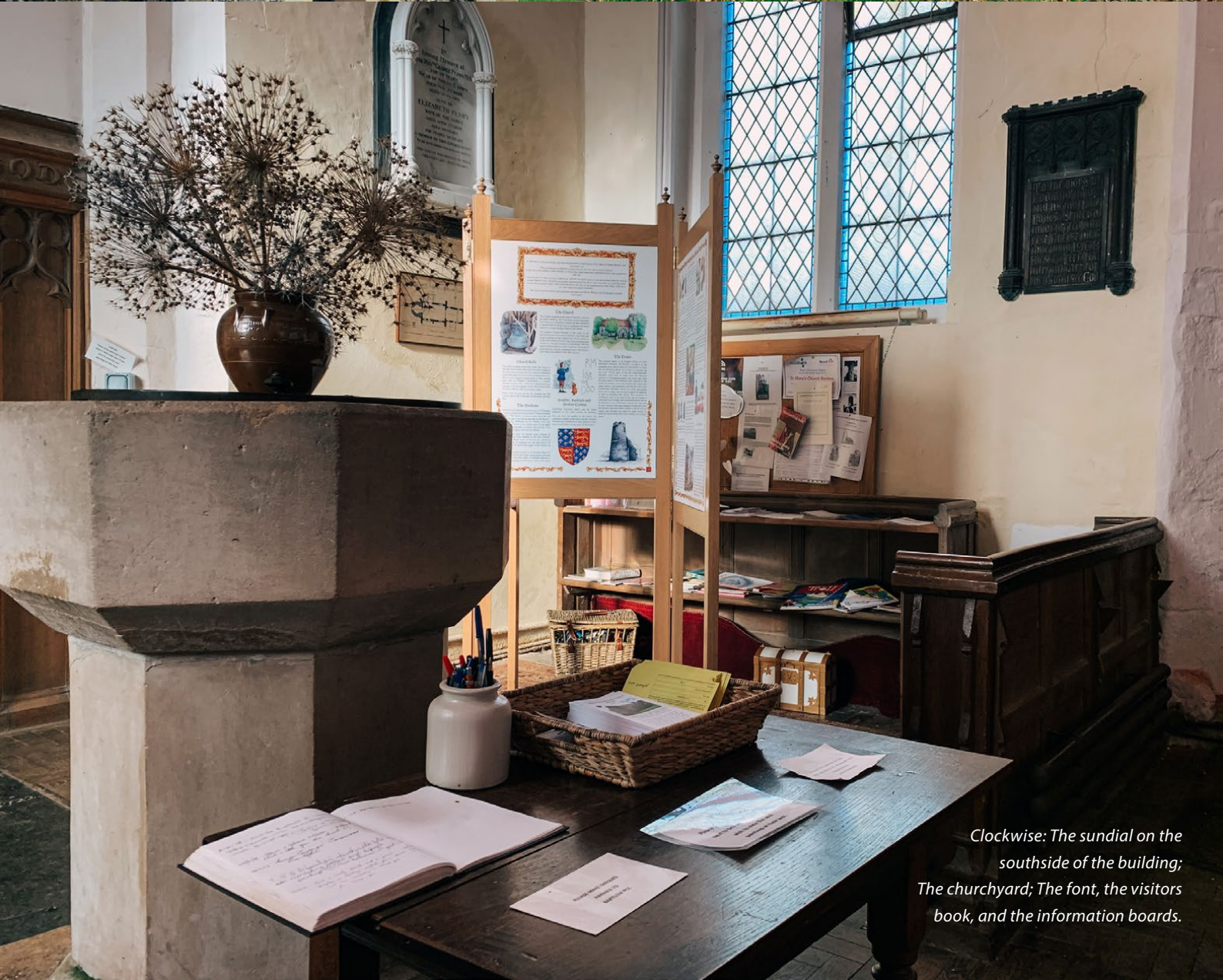
Clockwise: The sundial on the southside of the building; The churchyard; The font, the visitors book, and the information boards.