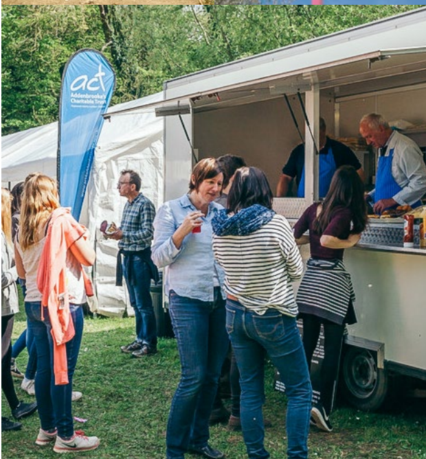
Three Counties Charity Walk.