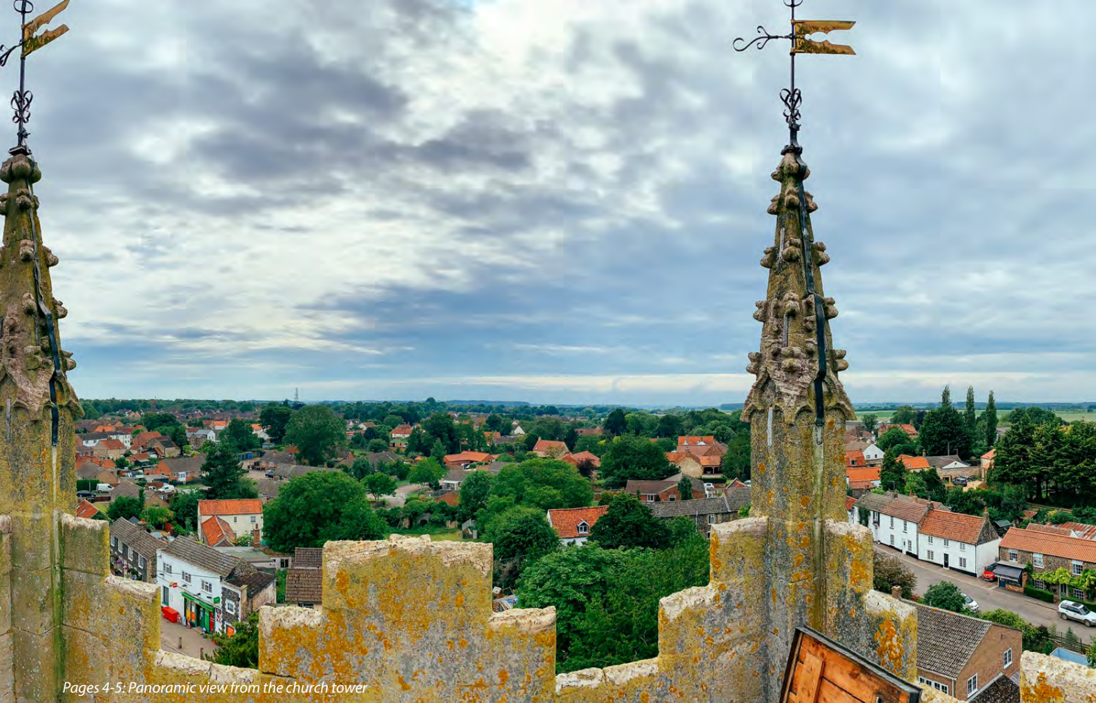
Pages 4-5: Panoramic view from the church tower