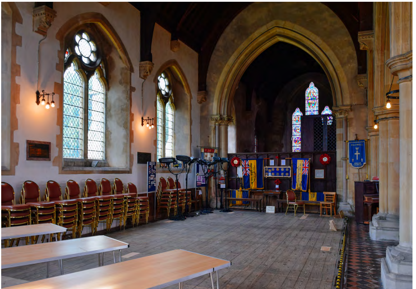
Space for community events in the north aisle.