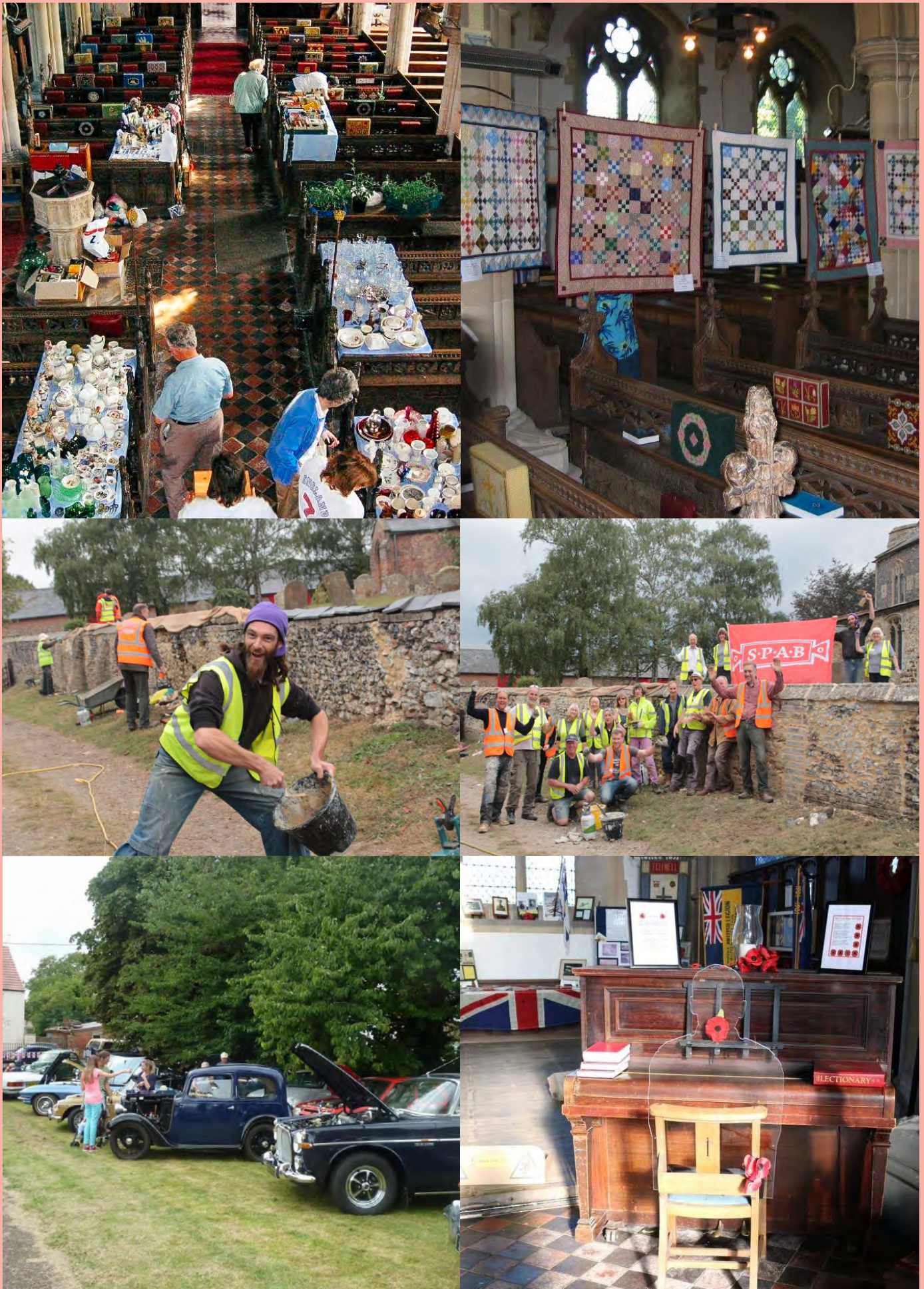
Top: Village Yard Sale; Quilt exhibition. Middle: Faith in Flint project with 68 volunteers helping to repair the boundary wall of the churchyard at St Nicholas. Bottom: Car show; Remembrance Day in the church.