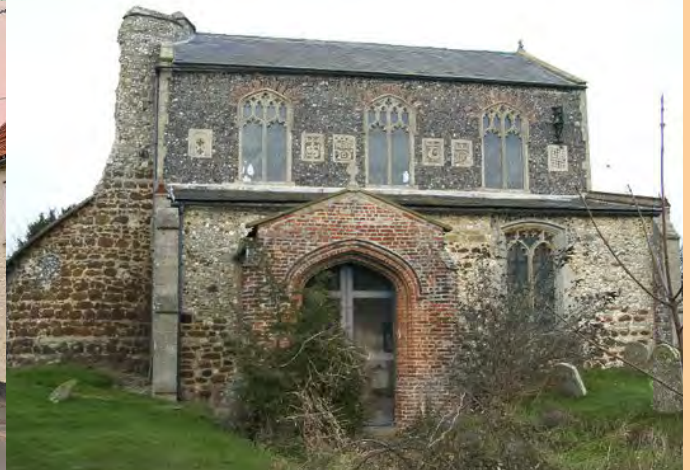
Top: View of the church and the churchyard from the East. Middle: North wall of the church. Bottom: Church tower visible from the road; St Nicholas church building.