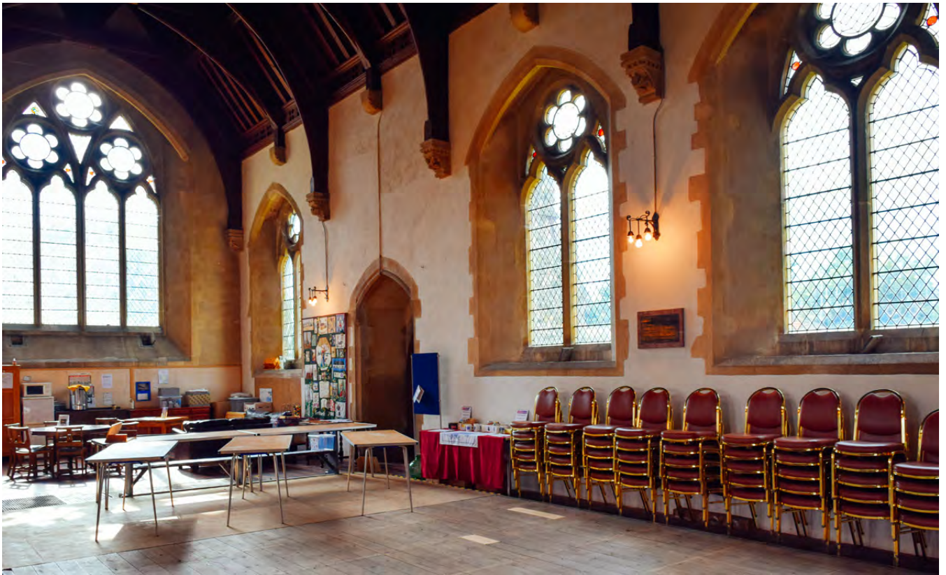
Top: Space for community events in the north aisle subsequent to removal of Victorian pews. Bottom: Social area with tables, chairs and sofa under the West window.