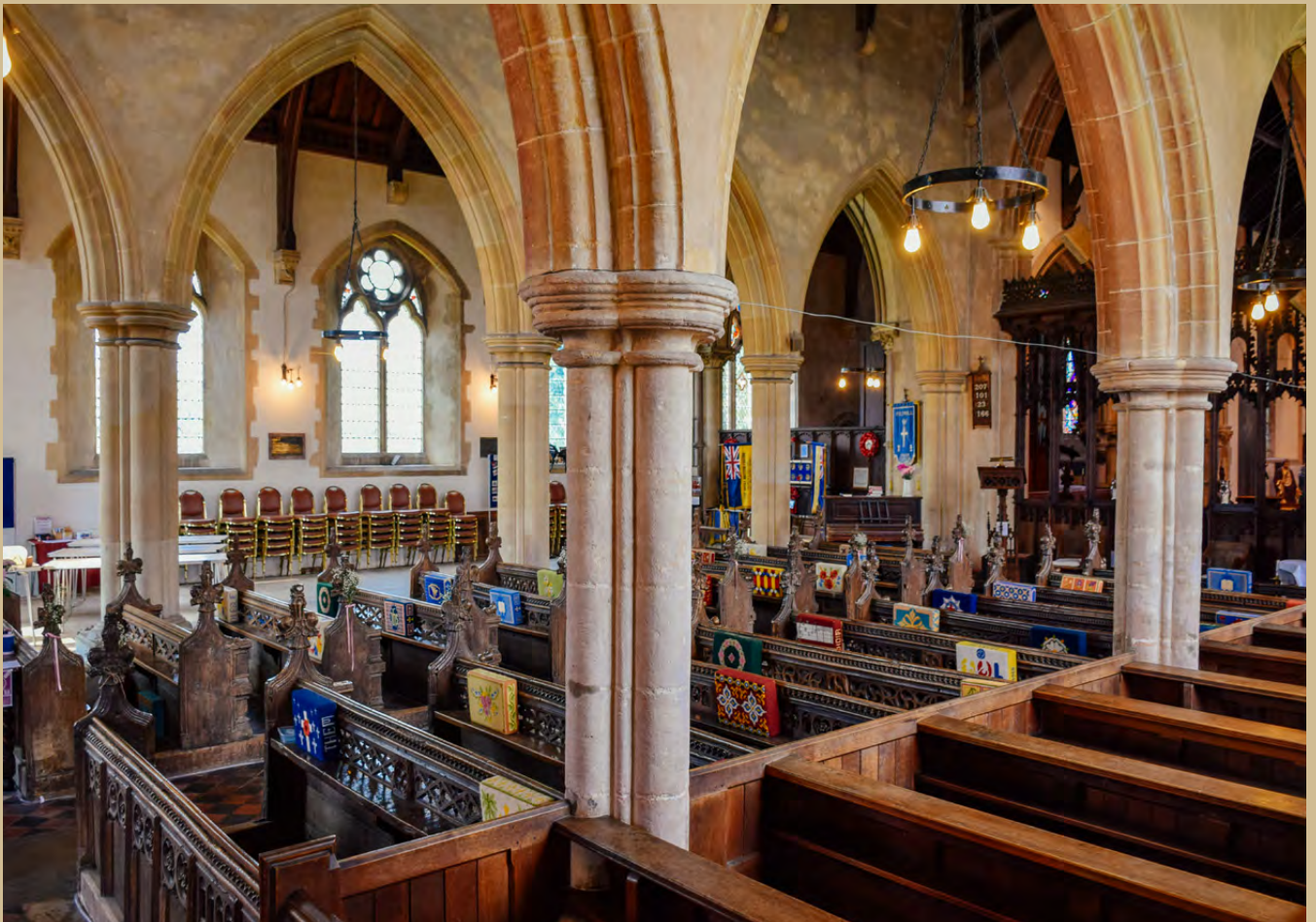
Top: View from the nave towards the chancel and rood screen.