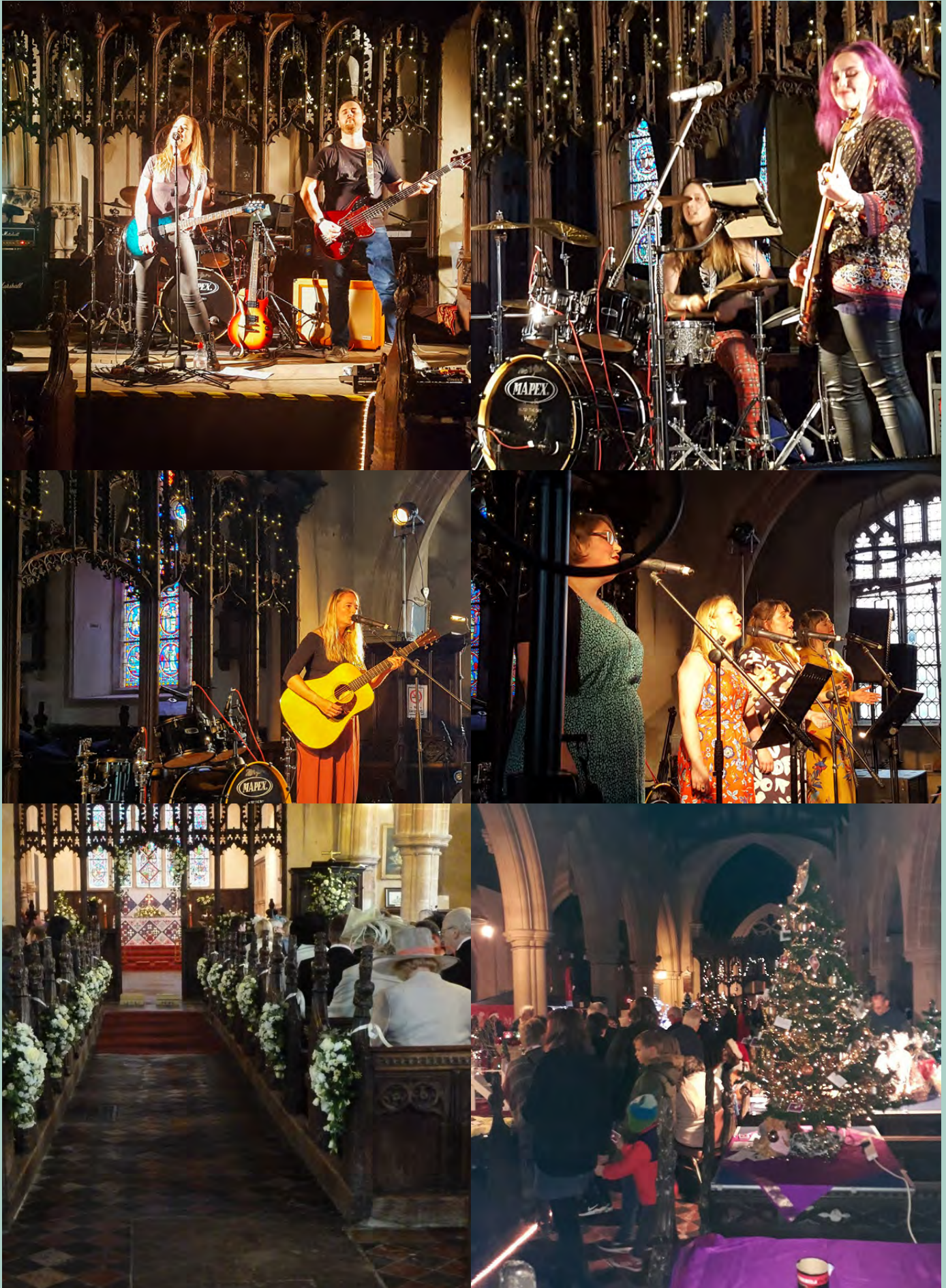
Top and middle: Music festival at St Mary's Feltwell in July 2019. Bottom: A wedding at the church; Christmas Tree and Festival of Lights event in December 2019 (Photos by Feltwell church).