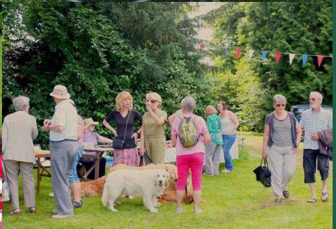
Top row: Members of St Michael's congregation at church service; Spring plant sale and coffee morning in aid of Neighbourhood Watch, Wormegay village hall, 2018. Middle and bottom: Benefice summer fete at the Old Rectory, June 2017.