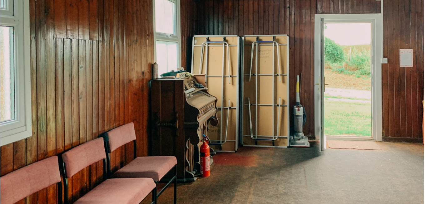
Top: Exterior of the Mission Room; Stone font at St Michael's church. Middle and bottom: Interior of the Mission Room.