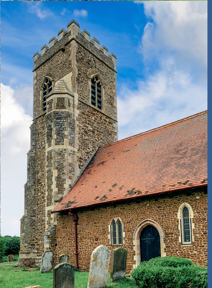
Top: View of the church building from south-west. Bottom: Exterior of the north wall; Church entrance and west tower.