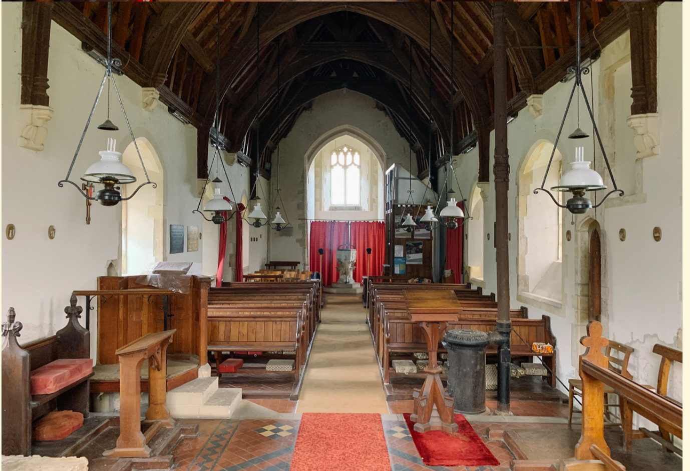
Top: View towards the chancel from the nave. Middle: Church nave with the font and the organ near west window.