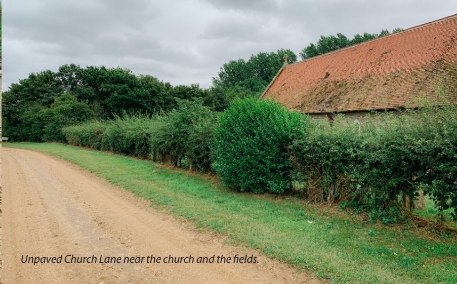
Unpaved Church Lane near the church and the fields.