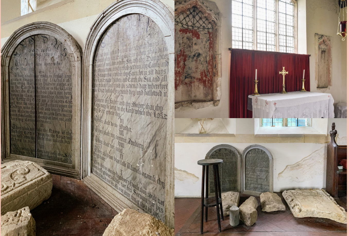
Top: Medieval paintings in wall niches on either side of the altar. Bottom: Carved stone memorials.